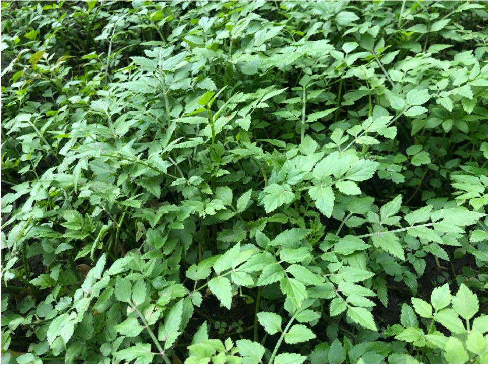
Close-up of water celery foliage and flowering water celery