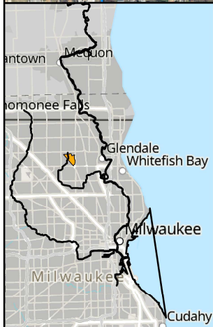
Figure 2. Project Area Map