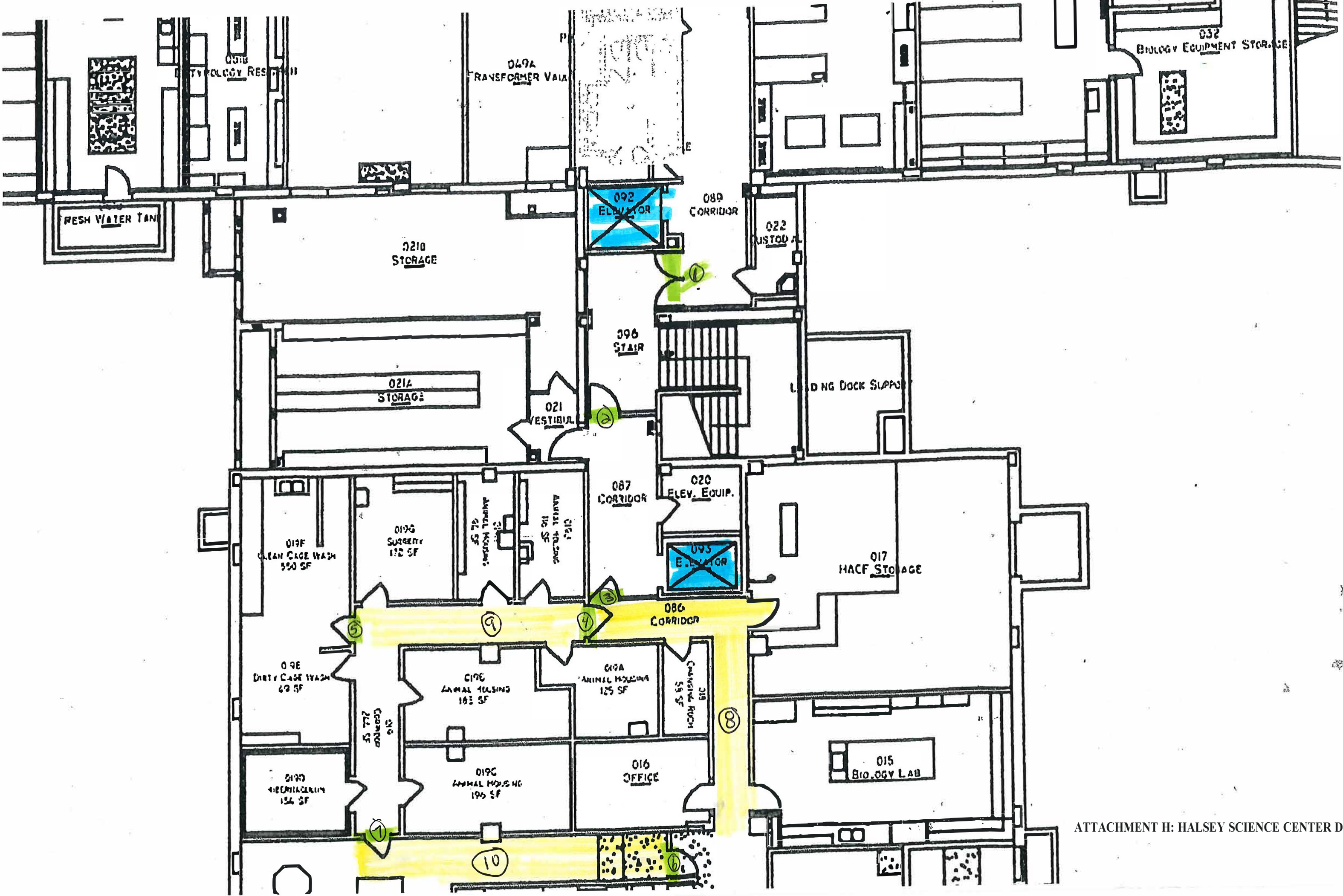
ATTACHMENT H: HALSEY SCIENCE CENTER DOOR